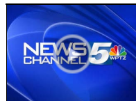
2011: Year Of The Storms