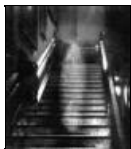
Some Of World's Most Famous Ghost Images