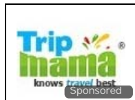
Holiday Inns - 65% OFF www.TripMama.com/Holid